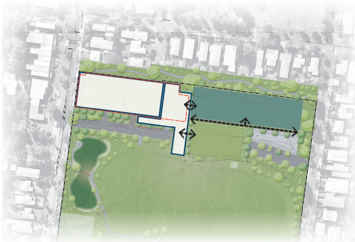
Figure 3 - Indoor Stadium and Chadstone Bowls Club at Percy Treyvaud Memorial Reserve

As shown in the above concept it is possible to accommodate an indoor stadium and redevelop Chadstone Bowls Club at Percy Treyvaud Memorial Reserve. Further work will be required to: