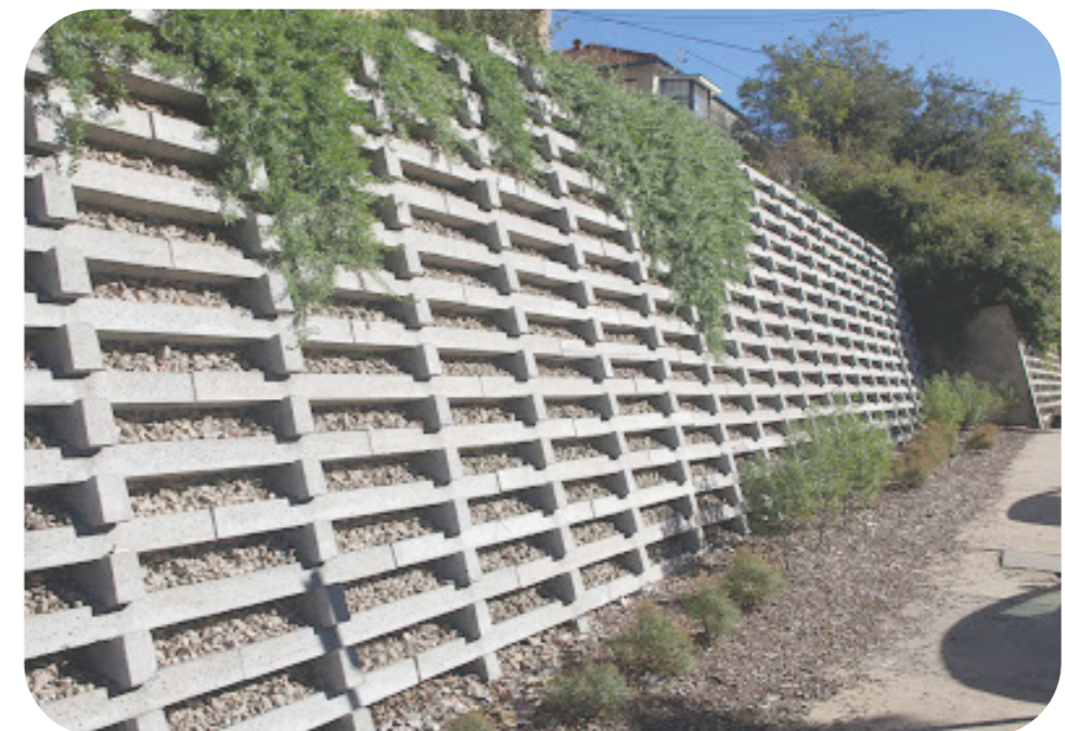
TYPICAL IMAGE (Concrete Crib Wall)

Proposed screen planting. Detailed landscape plan to be developed by council.