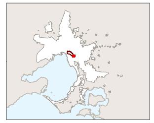
Part of Planning Scheme Maps 9DDO & 10DDO

Disclaimer This publication may be of assistance to you but the State of Victoria and its employees do not guarantee that the publication is without flaw of any kind or is wholly appropriate for your particular purposes and therefore disclaims all liability for any error, loss or other consequence which may arise from you relying on any information in this publication.