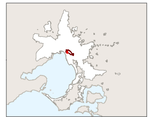
Part of Planning Scheme Map 5NCO

Disclaimer This publication may be of assistance to you but the State of Victoria and its employees do not guarantee that the publication is without flaw of any kind or is wholly appropriate for your particular purposes and therefore disclaims all liability for any error, loss or other consequence which may arise from you relying on any information in this publication.