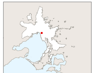
Part of Planning Scheme Map 5HO