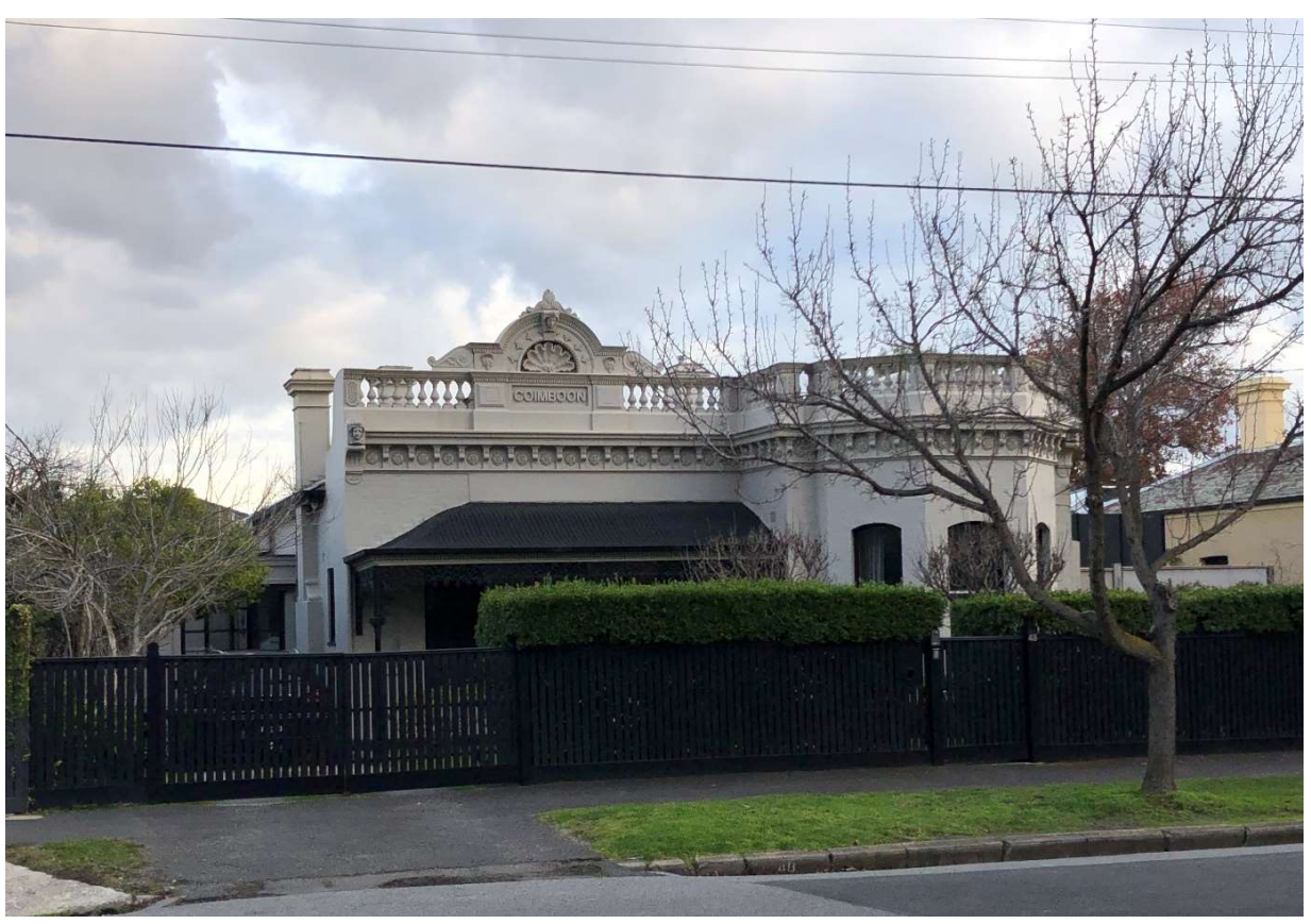
Figure 1.48 Stanhope Street, Malvern (GJM Heritage, July 2020).