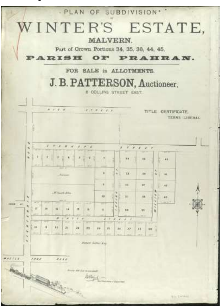
Figure 2. Winter's Estate subdivision, showing the original subdivision of the south side of Stanhope Street, 1881.