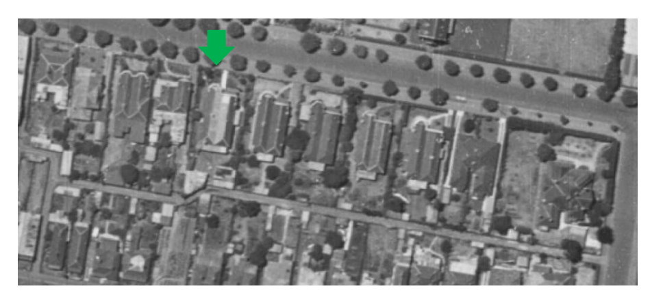
Figure 4. Aerial photograph showing houses at 44-54 Stanhope Street, Malvern, 1945. Green arrow indicates no. 48