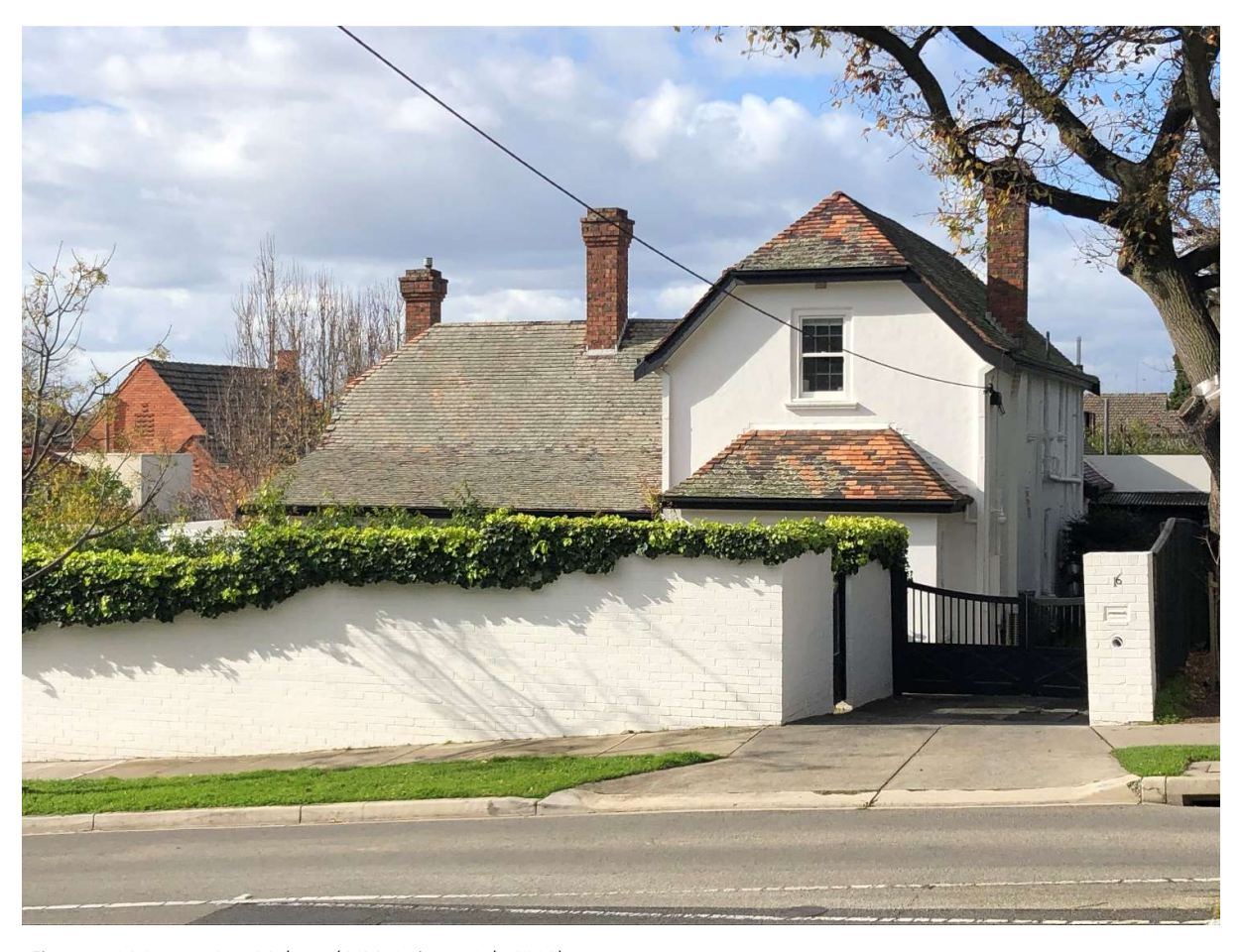
Figure 1. 16 Somers Ave, Malvern (GJM Heritage, July 2020).