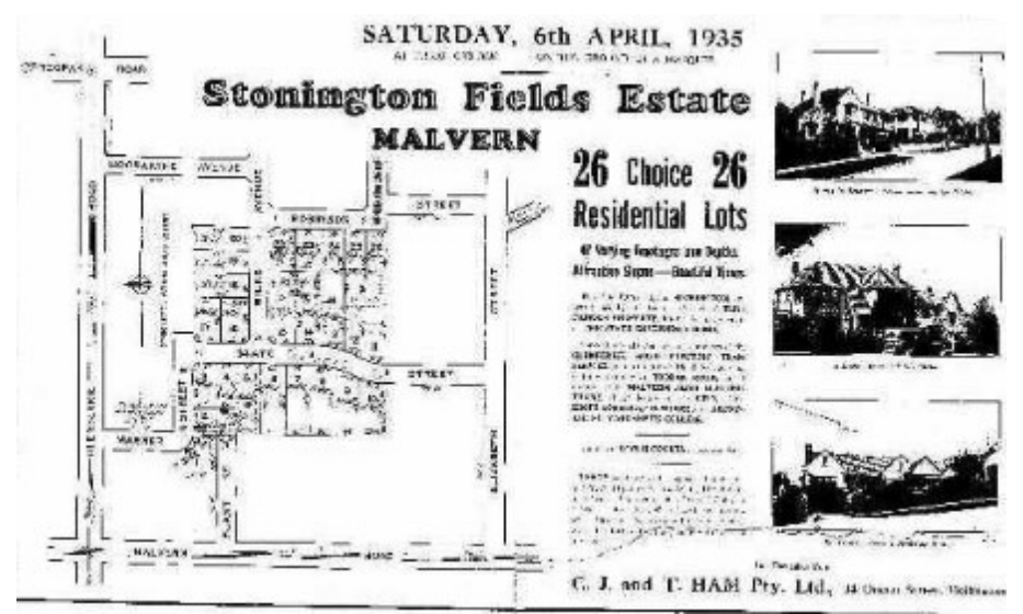
Figure 3. Auction notice for the Stonington Fields Estate, 1935.