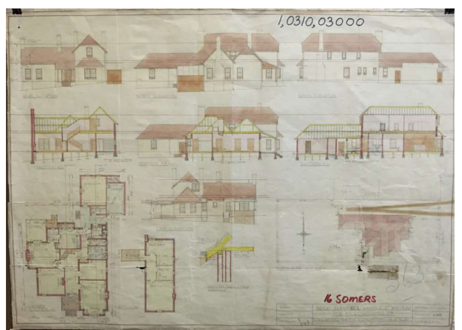
Figure 5. Brick residence Wagner Street, Malvern for F L Klingender, FL & K Klingender, 1935