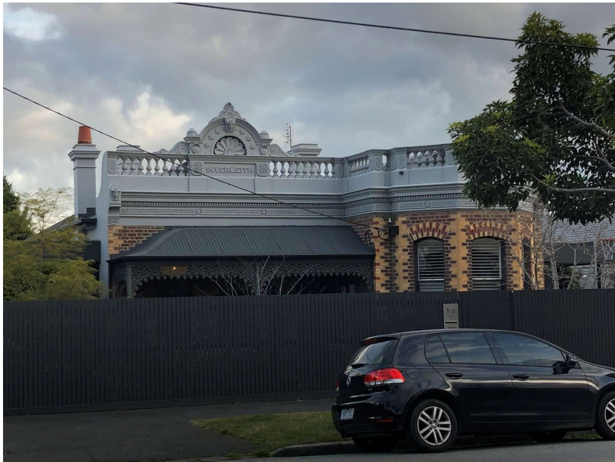
Figure 1. 50 Stanhope Street, Malvern.