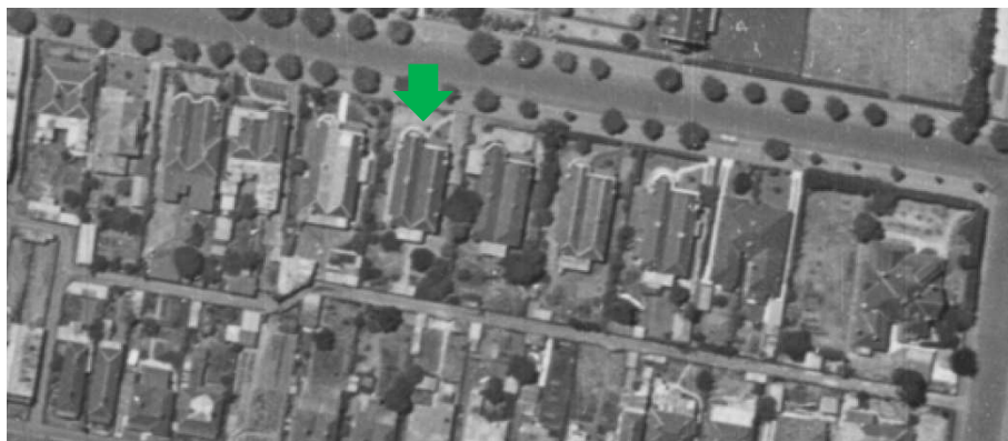
Figure 4. Aerial photograph showing houses at 44-54 Stanhope Street, Malvern, 1945. Green arrow indicates no. 50