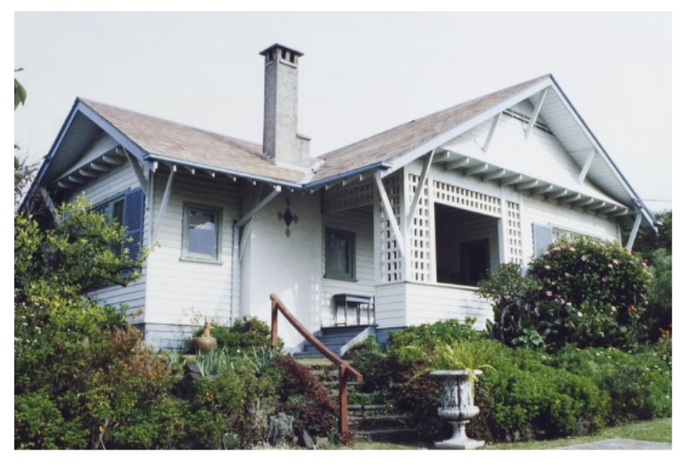
Figure 3. House from the northeast in 1992; the bay on the right fronts Toorak Road