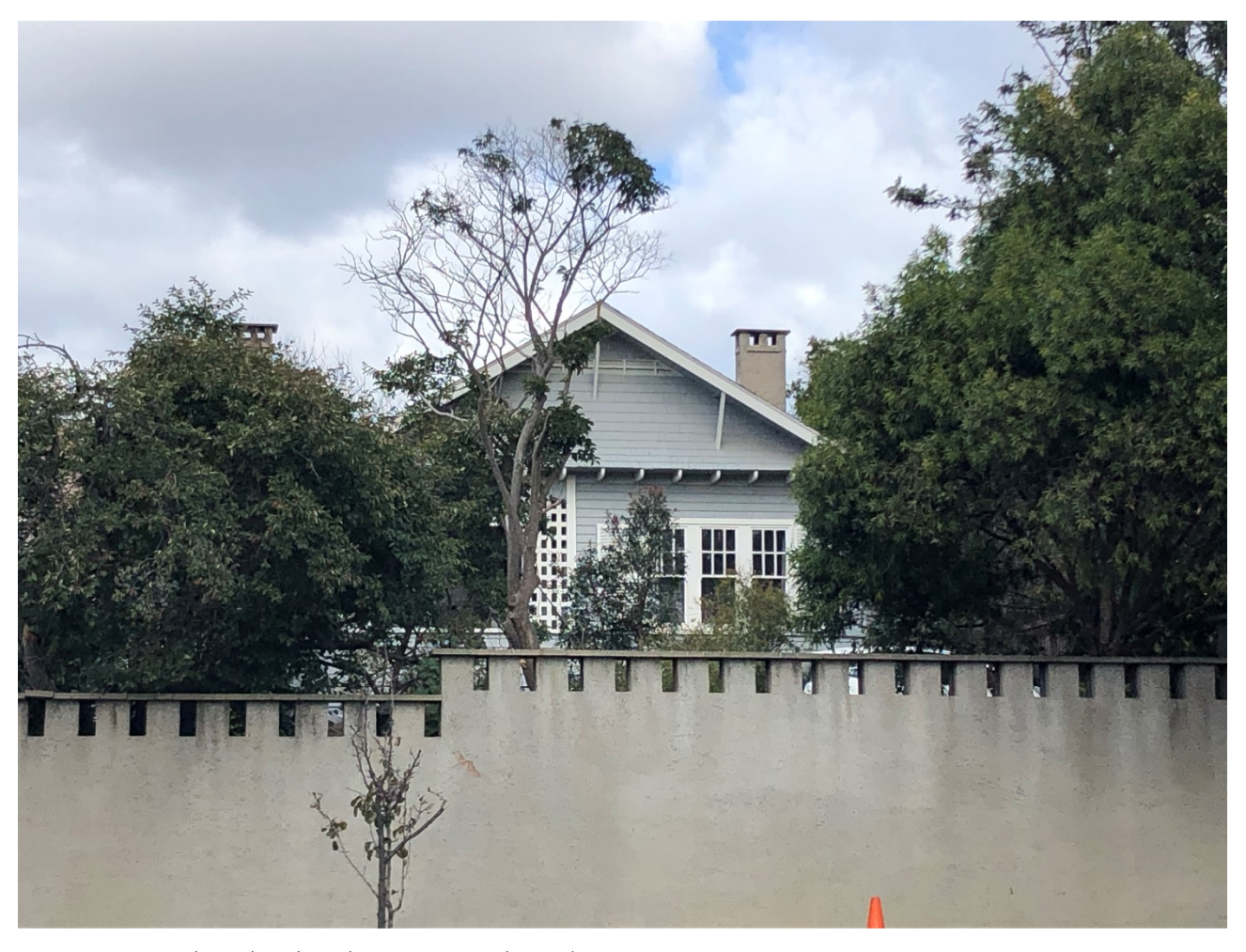
Figure 1. 704 Toorak Road, Malvern.