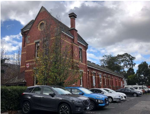
Figures 1-3. (R-L, top to bottom) St George's Anglican Church, Vicarage and Parish Hall (GJM Heritage, July 2020)