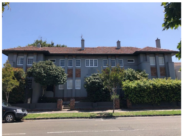
1, 3, 5 & 7 Northbrook Avenue and 1261 & 1263 High Street, Malvern (November 2020).