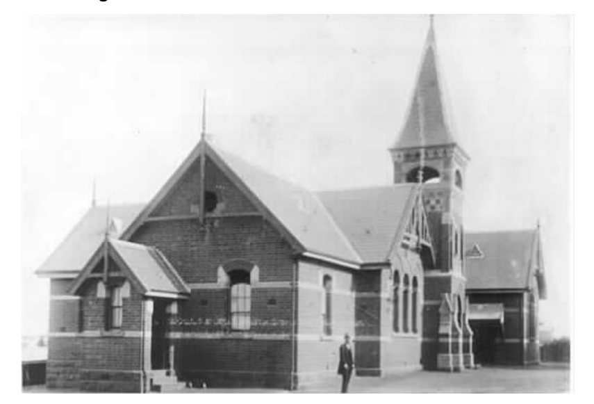
Figure 4. Photo dated 1890, with a view of the school from the north showing the first additions, including the tower, made to the building in 1889-90 in the foreground. Further additions were made to the north end in 1907-08.

Figure 5. Extent of the school in 1902, as evident on MMBW Plan No 59, Malvern, dated 1902