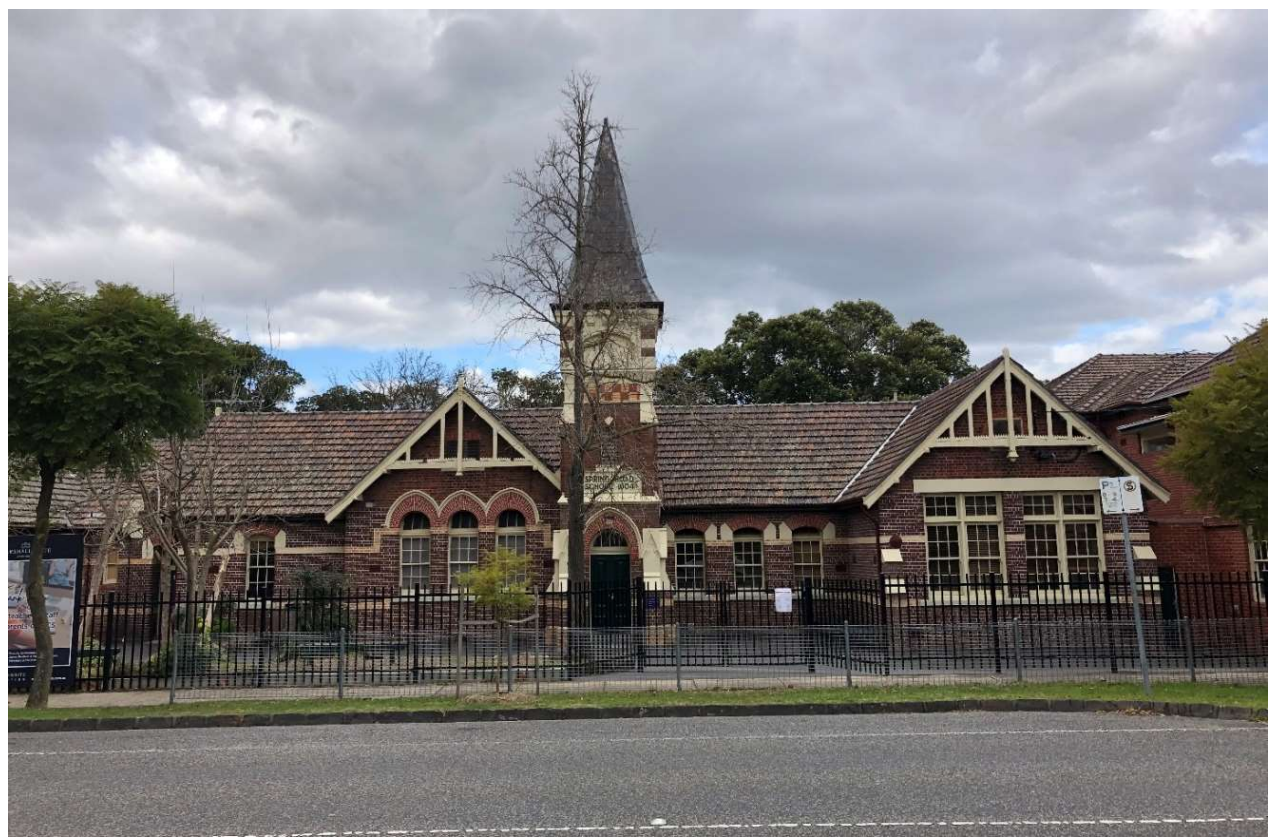
Figure 1. Primary School No 1604 – 2B Spring Road, Malvern (GJM Heritage, July 2020).