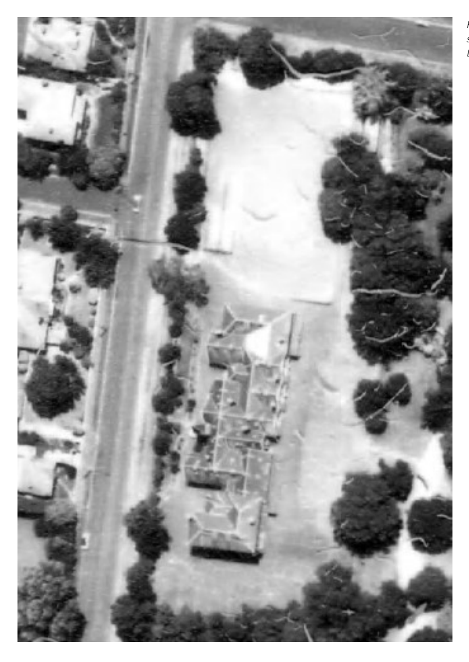
Figure 8. Detail of aerial view of site, 1963