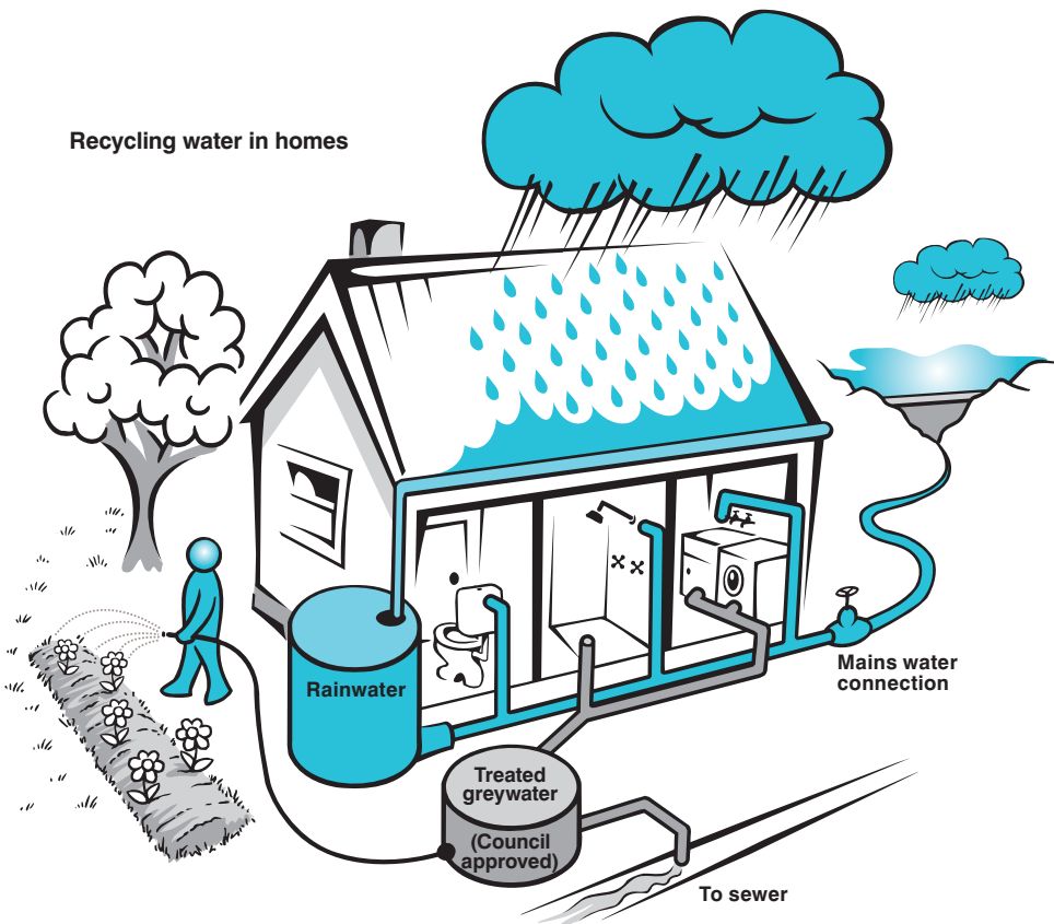
Recycling water in homes

Prior to planning a greywater treatment system, you need to obtain advice from a licensed plumber, the Department of Health and the Environment Protection Authority. A permit from Council is required.