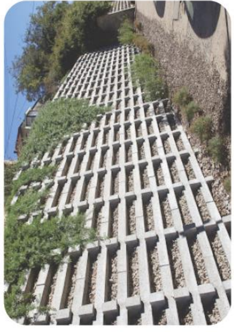
TYPICAL IMAGE (Concrete Crib Wall)

Proposed screen planting. Detailed landscape plan to be developed by council.