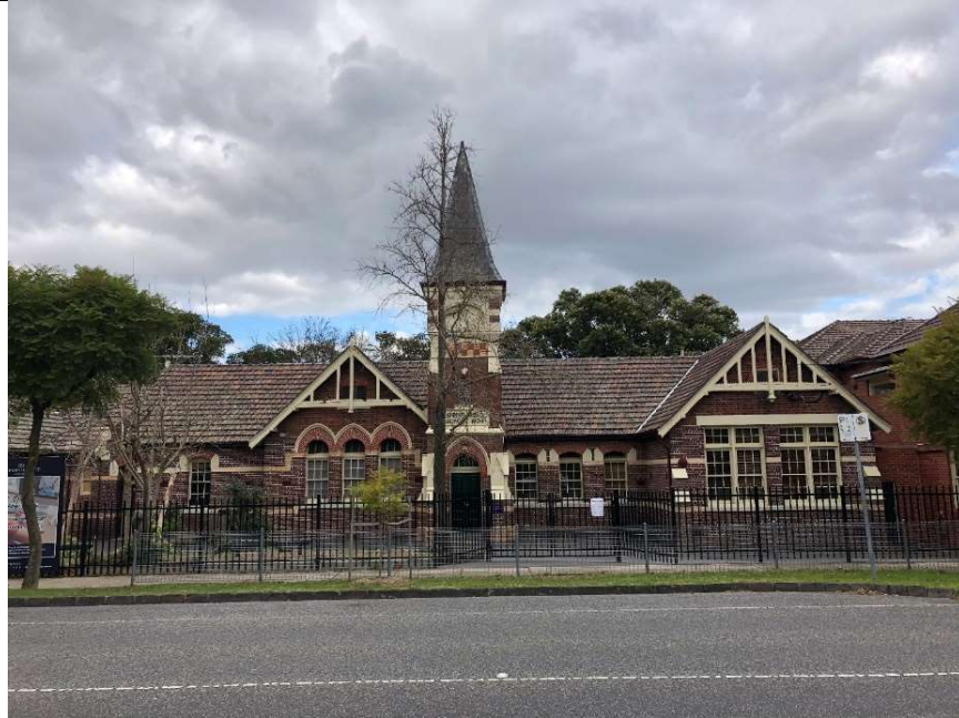
Figure 1. Primary School No. 1604