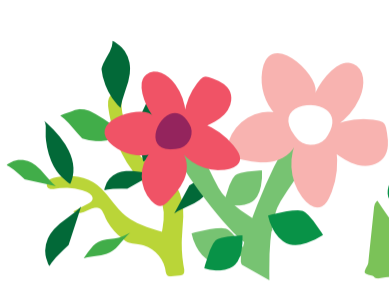
Garden prunings and weeds