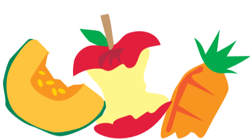
Fruit and vegetable scraps