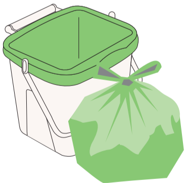
Certified compostable lime green liners – (AS4736)