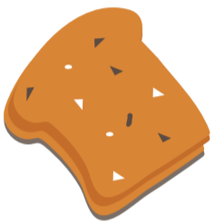
Bread, cereal, rice, noodles, pasta