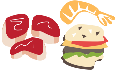
Meat, seafood and leftovers