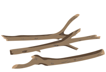
Small branches (up to 10 cm)