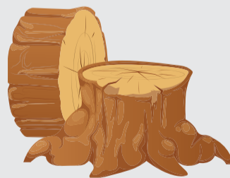
Tree stumps and large branches