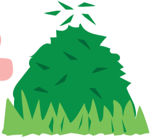
Grass clippings, leaves and bark