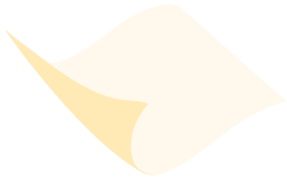
Small amounts of paper towels, napkins and newspaper