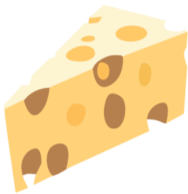
Cheese and dairy