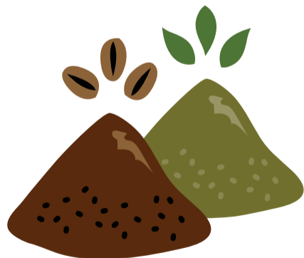
Loose tea leaves and coffee grounds