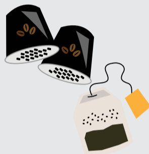
Tea bags and coffee pods