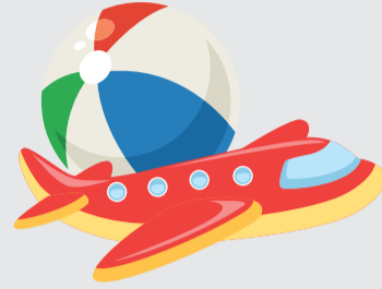
Balls and toys