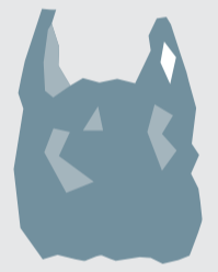
Plastic bags and wrap