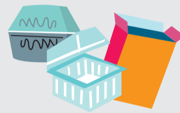
Food packaging (plastic, cardboard or compostable)