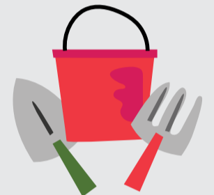
Hoses, garden pots