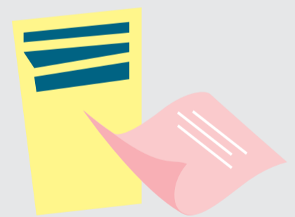
Stickers and labels