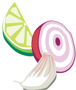
Citrus, onions, garlic